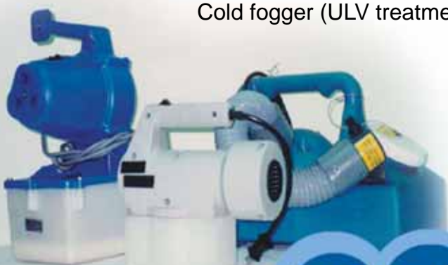
Cold fogger (ULV treatment)

For proper use of the cold fogger, it is essential to follow the instructions in the operation manual that comes along with the machine. Regarding precautionary measures, it is similar to those for thermal fogging except that it does not cause visibility hazard for motorists.